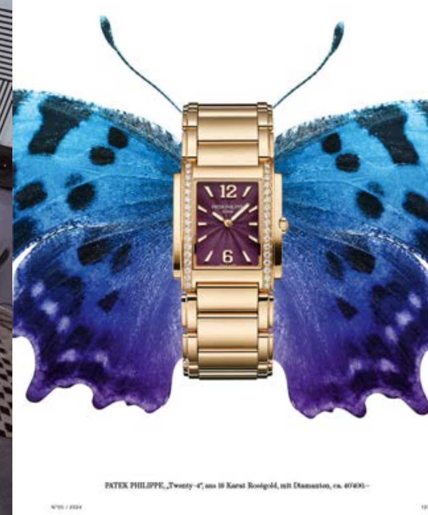
PATEK PHILIPPE, „Twenty-4“, aus 18 Karat Rotgold, mit Diamanten, ca. 40000,-